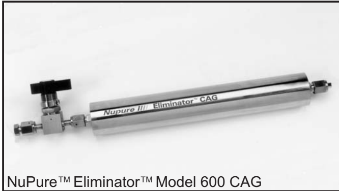
NuPure™ Eliminator™ Model 600 CAG